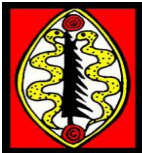
Aboriginal Legal Rights Movement Inc