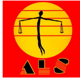
Aboriginal Legal Service of Western Australia