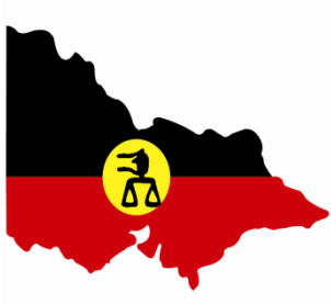
Victorian Aboriginal Legal Service Co-operative Ltd