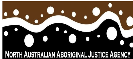
NORTH AUSTRALIAN ABORIGINAL JUSTICE AGENCY