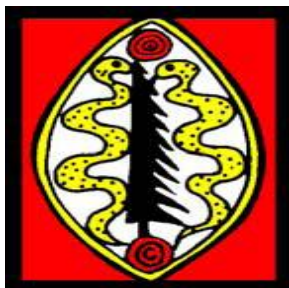
Aboriginal Legal Rights Movement Inc